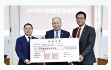
The donation ceremony for HEMBA classroom namina

The donation from Zhi-Tech Group for the reconstruction project of Beijing campus