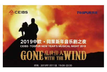
CEIBS · TOSPUR New Year's Musical Night 2019