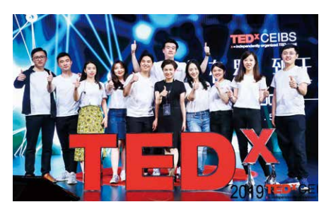
TEDxCEIBS 2019 Event Planning & Execution Team

Representative of TEDxCEIBS 2019 Event Planning Team